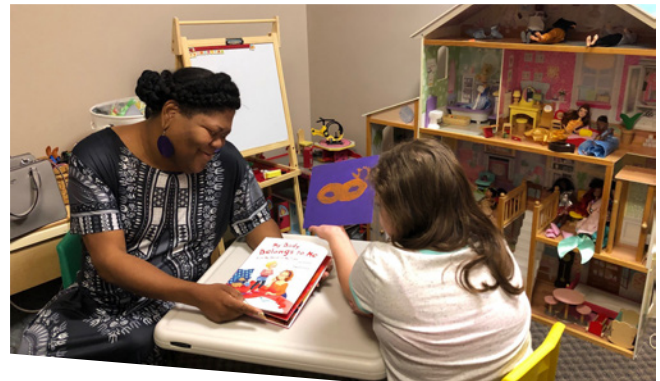
Child Advocacy Center, Inc.